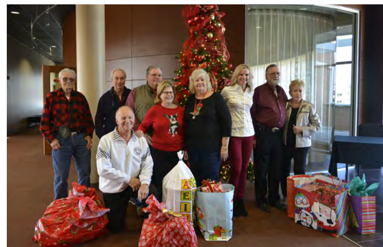
Pictured Right: Members of the Corvette Club of Texas helped distribute gifts to Gill families last December. Gill selected eight families who were especially in need this holiday season to receive special gifts. The Club shopped for each child using a wish list that each child wrote with the help of their parents. The children received tennis shoes, games, gift cards, and much more. The Corvette Club of Texas has supported Gill families in this way for over 15 years.